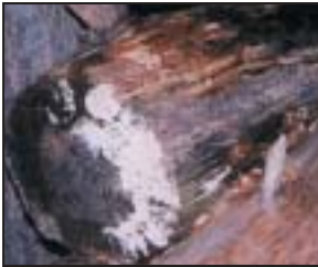
Mold growing outdoors on firewood. Molds come in many colors; both white and black molds are shown here.

natural environment. Outdoors, molds play a part in nature by breaking down dead organic matter such as fallen leaves and dead trees, but indoors, mold growth should be avoided. Molds reproduce by means of tiny spores; the spores are invisible to the naked eye and float through outdoor and indoor air. Mold may begin growing indoors when mold spores land on surfaces that are wet. There are many types of mold, and none of them will grow without water or moisture.