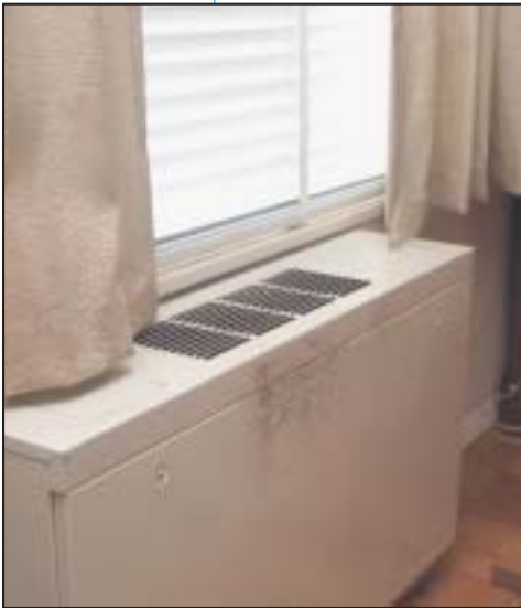
Mold growing on the surface of a unit ventilator.