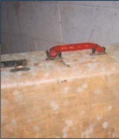
Mold growing on a suitcase stored in a humid basement.

It is important to take precautions to LIMIT YOUR EXPOSURE to mold and mold spores.