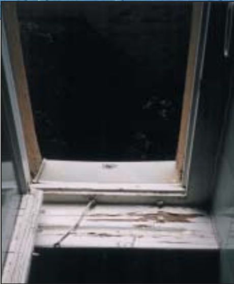
Leaky window – mold is beginning to rot the wooden frame and windowsill.

If you already have a mold problem – ACT QUICKLY. Mold damages what it grows on. The longer it grows, the more damage it can cause.