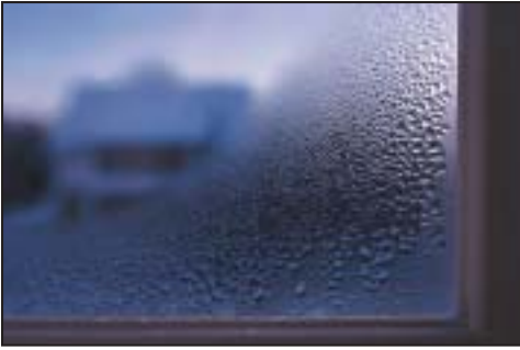
Condensation on the inside of a windowpane.