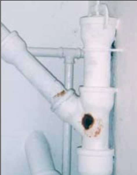
Rust is an indicator that condensation occurs on this drainpipe. The pipe should be insulated to prevent condensation.

Renters: Report all plumbing leaks and moisture problems immediately to your building owner, manager, or superintendent. In cases where persistent water problems are not addressed, you may want to contact local, state, or federal health or housing authorities.