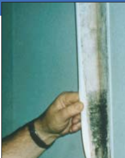
Mold growing on the back side of wallpaper.

Suspicion of hidden mold You may suspect hidden mold if a building smells moldy, but you cannot see the source, or if you know there has been water damage and residents are reporting health problems. Mold may be hidden in places such as the back side of dry wall, wallpaper, or paneling, the top side of ceiling tiles, the underside of carpets and pads, etc. Other possible locations of hidden mold include areas inside walls around pipes (with leaking or condensing pipes), the surface of walls behind furniture (where condensation forms), inside ductwork, and in roof materials above ceiling tiles (due to roof leaks or insufficient insulation).